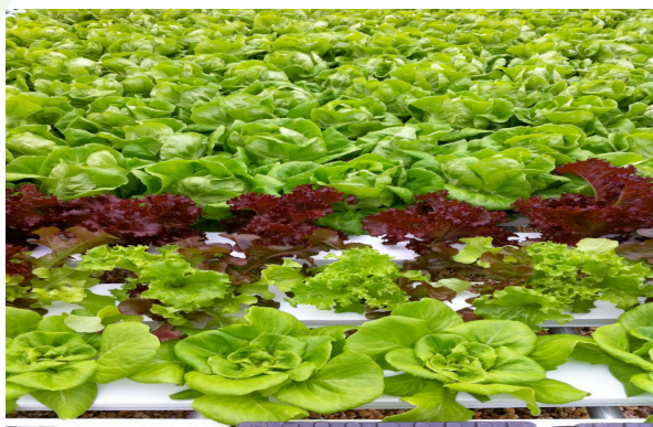
Bibb lettuce on Nutrient Film Technique (NFT) Growing System

A typical lettuce growing cycle takes five to six weeks, depending on season and weather conditions. Minimum Bibb lettuce weight to market is 4.0 oz.